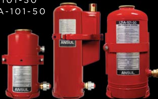
LT-LP-A-101-20 A-101-30 LT-A-101-50